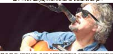
Max Herre reißt mit Konzert am Mainzer Zoohof